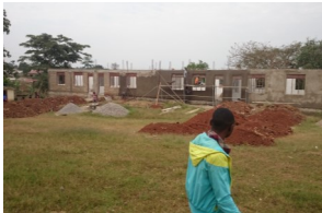
Work at the new classroom block

We are thankful to God for the continued work of construction of the main block at Off Tu Education Center.