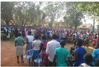
Praise and worship at the Youth conference

As part of our discipleship programs, we were involved in two annual children and youth conferences in Mityana and Bukedi dioceses. For Mityana, there were 1,785 participants. Our team was facilitating the running of the conference, music, and participated in teaching. The