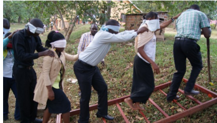
The team learning about teamwork

prayer day to dedicate the organization and staff to God. After the training, all members joined up in the construction work at school and preparation of vehicles for outreaches.